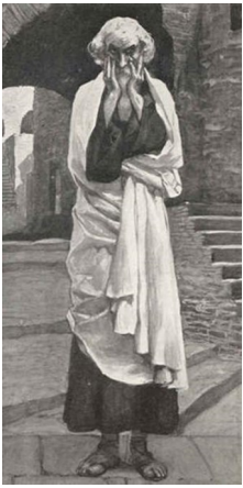
James Tissot: Prophet Micah, 1896.