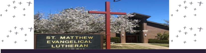
ST. MATTHEW EVANGELICAL LUTHERAN

All voting members of the church ( adult contributing members and confirmed youth ) are encouraged to attend